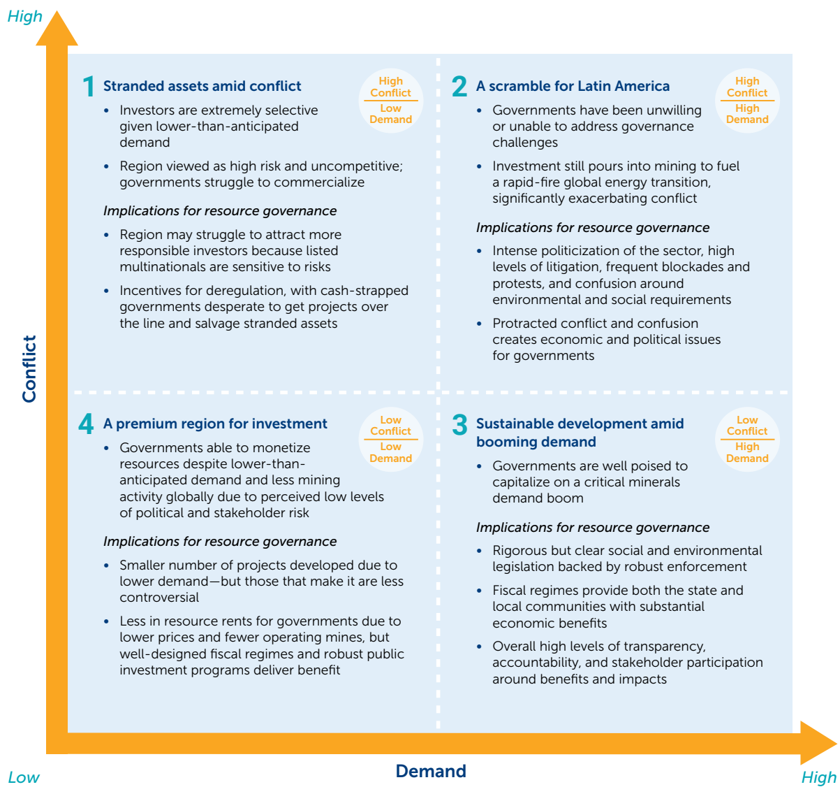
FIGURE 1. Potential Scenarios for Critical Minerals Development*