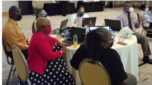
Figure 2: Representatives from the Ministry of Sport & Community Development Participate in EIP Capacity Building Workshop