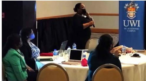
Figure 3: Participants from the Ministry of Planning & Development Participate in EIP Capacity Building Workshop

The follow-on coaching program for policymakers helped reinforce the skills they acquired in the workshop and further identified gaps and solutions for developing EIP systems. The policymakers who received coaching and training subsequently shared tools and skills with colleagues at their respective ministries and through career development activities such as continuing education programs.