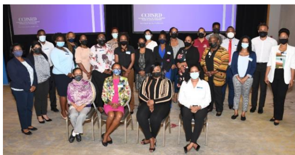
Figure 1: Social sector ministries come together for EIP Capacity Building Workshop

In April 2021, the Caribbean Centre for Health Systems Research and Development (CCHSRD), a PEERSS partner in Trinidad and Tobago, had the opportunity to help four social sector ministries—Labour, Social Development and Family Services, Planning and Development, and Sport and Community Development—expand their EIP capacities.