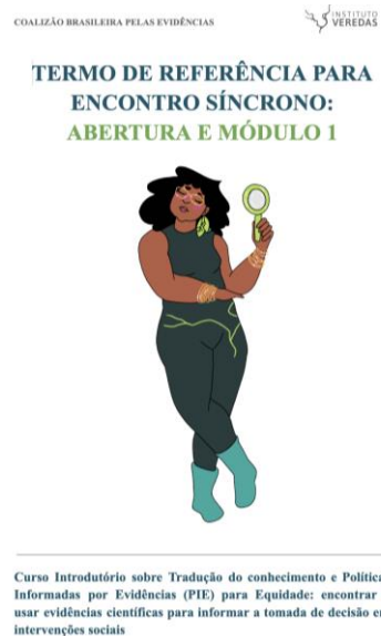
Figure 2: Terms of Reference for the course, showcasing SuperEvident, an evidence-informed hero

Our next steps include continued outreach to expand Brazil's knowledge translation community in addition to our ongoing efforts to promote access to EIP knowledge. We're excited about these possibilities and believe that we can spread awareness of EIP to a diverse group of people and help build the capacity of the next generation of Brazil's knowledge translation community.